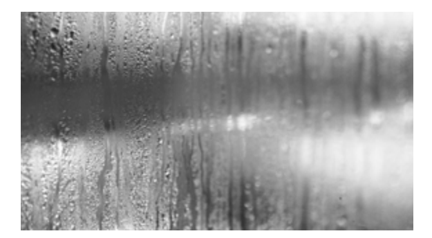
The automatic humidity control system (AHC) precisely regulates the amount of steam in the cooking chamber and creates the ideal climate for the meals that are being prepared.