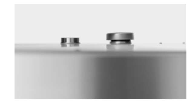
A highly powerful flap will provide an immediate discharge of residual moisture from the cooking chamber. This will result in a perfect crispness and accurate colour of foods.